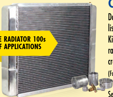
ONE RADIATOR 100s OF APPLICATIONS