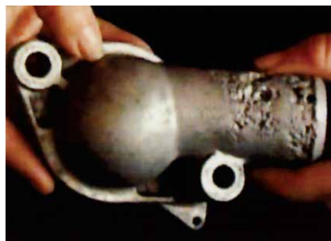
Without Sacrificial Anode Radiator Cap, the thermostat housing cover shows major deterioration after 60,000 miles.