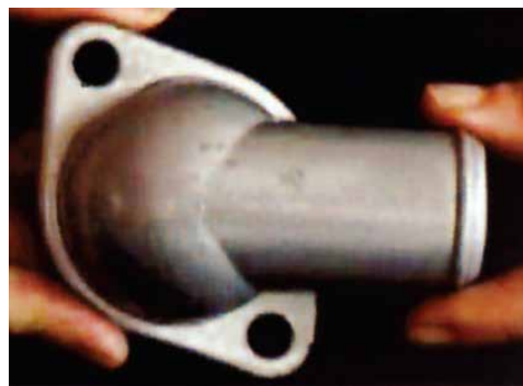
After 60,000 miles with the Sacrificial Anode Radiator Cap patented technology the effects of electrolysis that can ultimately destroy the entire cooling system are dramatically reduced.