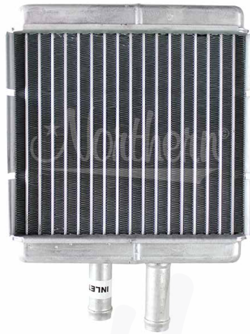
AH483 Aluminum heater core/Hupp Heaters, 5 1/2" x 6" x 2"