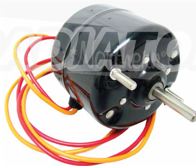
AH451 Clockwise rotation 12 volt motor for auxiliary heaters