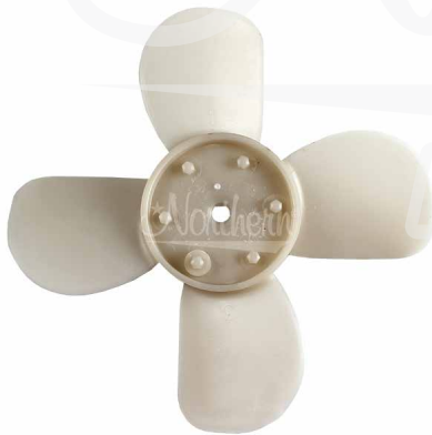
AH452 6" Fan blade for auxiliary heaters