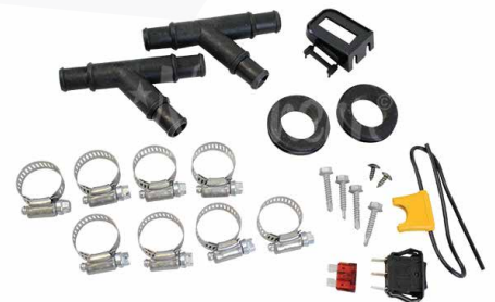
AH450 Auxiliary heaters installation kit